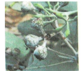
Fruit and buds